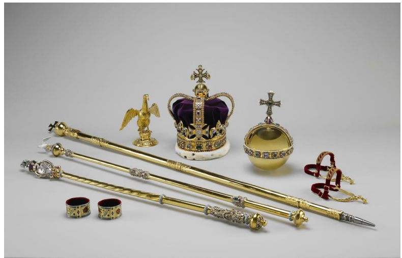
Crown Jewels used in yesterday's coronation

Sunday 7 th May 2023, following the Coronation of King Charles III